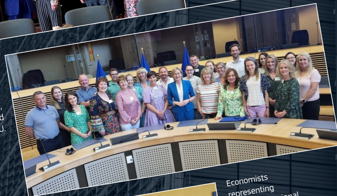
Economists representing NGOs, professional associations, think tanks and financial institutions focused on discussing the European Semester during their visit.