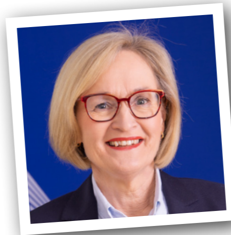
Mairead McGuinness European Commissioner for Financial services, financial stability and Capital Markets Union

I would like to thank all participants in our many events, the organisers, NGOs, representative groups, schools and Commissioners, as well as the Representation's staff for their contribution to our programme in the course of the year. Particular thanks goes to Mairead Mc Guinness, European Commissioner for Financial Services, financial stability and Capital Markets Union who has actively supported the Representation's work and enhanced its impact. I hope you find the information in this brochure on our main activities in 2022 interesting – happy reading!