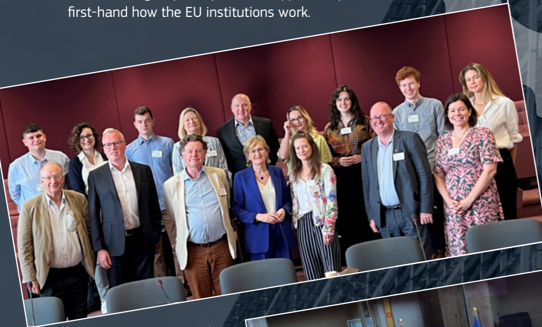
Journalists from across Ireland meet with Commissioner McGuinness during their visit to Brussels in June 2022

During 2022, the Representation began organising in-person study visits to Brussels once again. Groups of teachers, journalists and economists had the opportunity to travel to Brussels for briefings on topical issues at the European Commission, meet Commissioner Mairead McGuinness and Irish MEPs. These visits give participants the opportunity to learn first-hand how the EU institutions work.