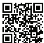
DiscoverEU travel pass

How to apply: Applications open in spring and autumn on the European Youth Portal. Complete the quiz and make sure you have a valid passport. Successful applicants are notified by email and all participants are invited to become DiscoverEU ambassadors.