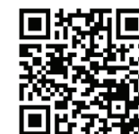
Register in the European Solidarity Corps online portal