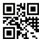
Find a Eurodesk Ireland contact point

"I learned a lot about myself during my year in Spain, experiencing a different everyday environment and meeting so many new people. I would recommend it to anyone. Even two years later, I am still in contact with the friends I made there."