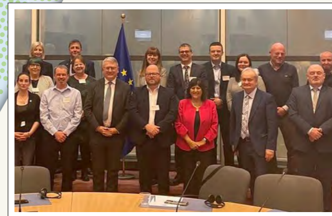
Trade union representatives on a visit to Brussels in November 2023

Some environmental NGO representatives travelled to and from Brussels by 'slow travel', taking a ferry and two trains instead of a single flight, proving that sustainable travel is a viable alternative even for short journeys from Ireland to the continent.