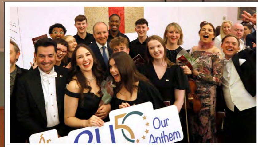
On Europe Day, 9 May, Tánaiste Micheál Martin, together with the Representation and the European Parliament Liaison Office in Ireland, hosted a gala concert at the National Concert Hall commemorating Ireland's 50 years of membership of the European Union. The concert included a special performance of Beethoven's Ninth Symphony by the National Symphony Orchestra accompanied by an 'EUSO Choir'.