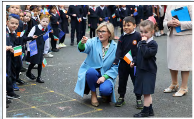
Commissioner McGuinness visited a number of primary schools that participate in the Blue Star programme, which teaches primary school pupils about European cultures & the EU.