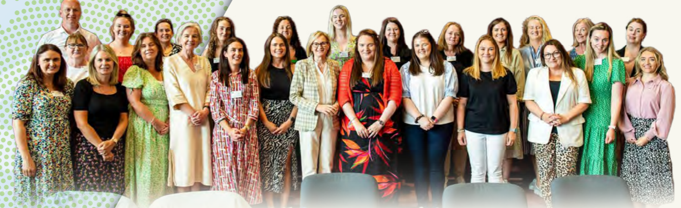
School teachers on a visit to Brussels in July 2023 met with Commissioner McGuinness

The Representation organised 6 study visits to Brussels in 2023. Irish journalists, teachers, economists, trade unionists and environmentalists had the opportunity to travel to the heart of Europe and learn first-hand how the EU institutions work.