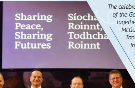
The celebration of the 25th Anniversary of the Good Friday Agreement gathered together EU Commissioner Mairead McGuinness, Tánaiste Micheál Martin, Taoiseach Leo Varadkar, UK Northern Ireland Secretary Chris Heaton-Harris and EU Commission Executive Vice-President Maroš Šefčovič on the stage of the Abbey Theatre in Dublin.