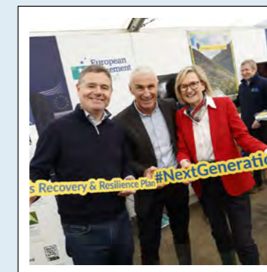
Commissioner McGuinness and Public Expenditure Minister Paschal Donohoe at the National Ploughing Championships in September.