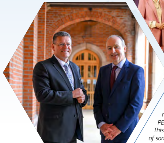
Solid cooperation between the European Commission and Irish and UK governments resulted in the start of the new PEACEPLUS programme in 2023. This will result in an investment of some €1.14 billion for building reconciliation and greater prosperity across Northern Ireland and the border counties of Ireland.