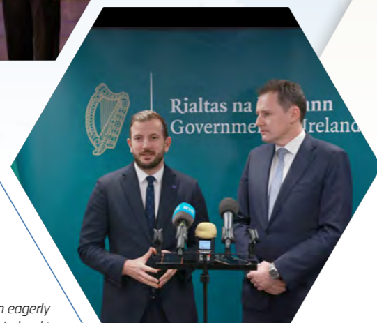
On an eagerly anticipated visit to Ireland in November 2023, EU Environment Commissioner Virginijus Sinkevičius held talks with Taoiseach Leo Varadkar and Agriculture Minister Charlie McConalogue on improving water quality in Ireland and the future of Ireland's derogation from the EU Nitrates Directive.