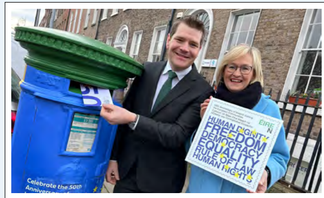
In January 2023, Commissioner McGuinness joined Minister for European Affairs, Peter Burke TD, to launch a new postage stamp to mark the 50th anniversary of Ireland's accession to the European Communities.