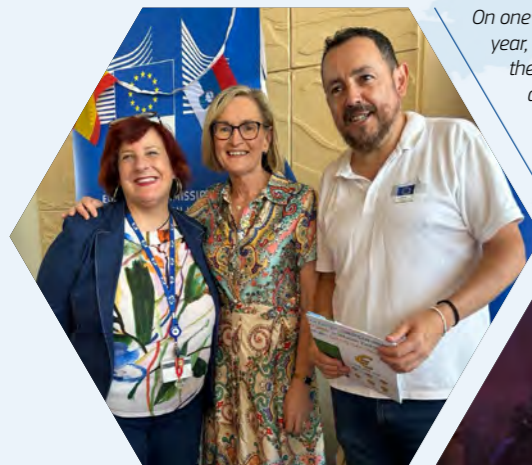
On one of her visits to Ireland throughout the year, Commissioner McGuinness attended the open day at the Directorate for Health and Food Audits and Analysis of the Directorate-General for Health & Food Safety in Grange, Co. Meath.