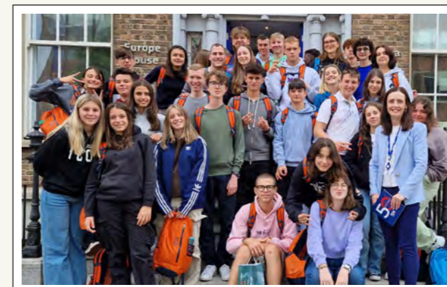
Italian students from TGS Eurogroup in July 2023

We met students from across Ireland including Dublin, Meath, Cavan, Galway, Kildare and Tipperary. We also welcomed visitors from Italy, Denmark, Sweden, France, the Netherlands, and Norway.