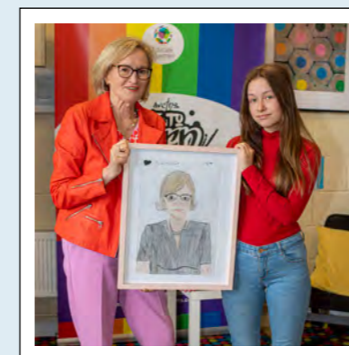
To mark Europe Day 2023, in May Commissioner McGuinness visited Aston Village Educate Together National School in Drogheda where she was presented with her portrait.

As the European Commissioner from Ireland, I was very happy to participate in a number of the Representation's events in 2023, to be out and about in Ireland meeting people and listening to how the EU impacts on the lives of citizens. This outreach is vital for the EU and I look forward to continuing this public engagement in 2024.