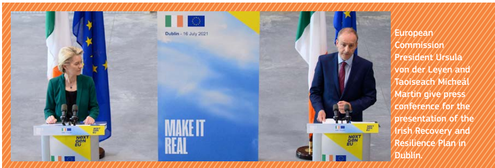
European Commission President Ursula von der Leyen and Taoiseach Micheál Martin give press conference for the presentation of the Irish Recovery and Resilience Plan in Dublin.