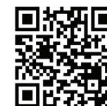
Register in the European Solidarity Corps online portal

But after enrolling and completing her volunteering, she then enrolled in a course to become a qualified Youth Worker and has continued to work and further her education.